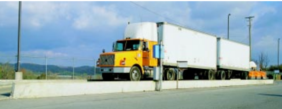
Weigh-Tronix axle weighing systems meet the requirements of the transportation industry with scale configurations to handle even double and triple trailer combinations.

If your business depends on your ability to move products efficiently, if truck transportation is what keeps you alive, if you prefer to operate safely as well as efficiently, then finding a way to get accurate axle weights is a clear necessity. Accurate axle weights mean no more fines for misloaded trucks. Accurate axle weights mean reduced liability in the case of an accident. Accurate axle weights mean an end to uneven loading and costly delays at check points.