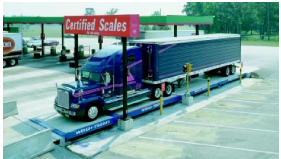
Weigh-Tronix multi-platform scales are a profitable choice for high volume commercial weighing applications.

Second, the WI-130 is totally programmable. Its versatile standard software meets the requirements of most normal axle weighing applications. If, however, you have a specialized application, you and your local distributor work together to define the function you need. Your distributor will be able to provide you