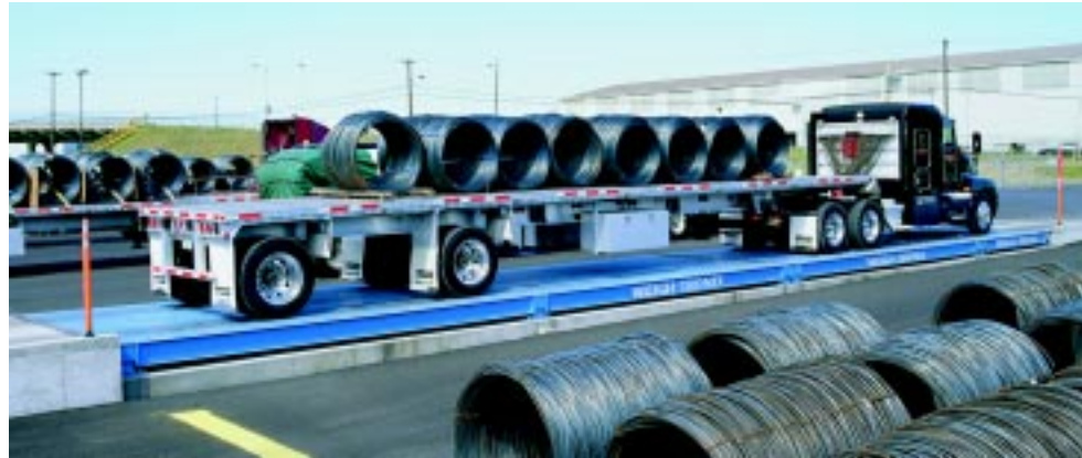
The flexibility of 10, 12, 20, and 24-foot modules from Weigh-Tronix makes it simple to match a scale system to multiple axle configurations.

extra long life. Its steel version features a 100% sealed weld, sandwich steel deck. Its concrete version positions all concrete for compression loading only. The concrete will not flex or bend which would result in cracks and early damage.